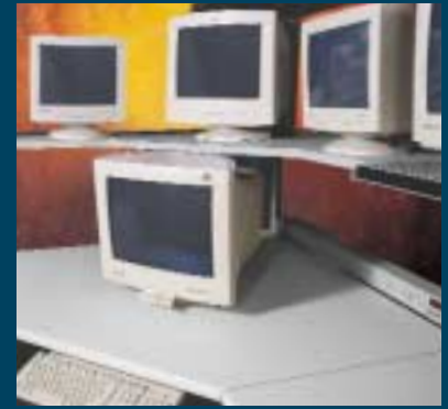
CORNER WORK SHELF: Accommodates monitors & other equipment.