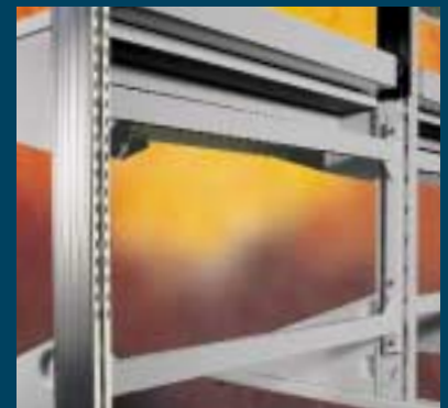
OPEN STABILIZER SYSTEM: Allows clear access to the rear of equipment positioned under a worksurface or on the floor.