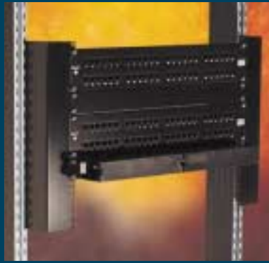
19" (48cm) RACK MOUNT BRACKETS: Mount hubs, patch panels or routers confidently and safely.

The Arlink family of Computer Furniture Systems provides a cost effective & efficient method of organizing network, test or analytical equipment. A variety of different module sizes may be interconnected in any combination to achieve the perfect layout for your application. Using Arlink's Definite Positioning System, the use of vertical space is maximized ensuring expensive real estate is put to full use while providing personnel with a highly productive work environment. The system's design also accommodates technicians, operators, or system administrators who need personal work space while simultaneously housing all associated equipment.