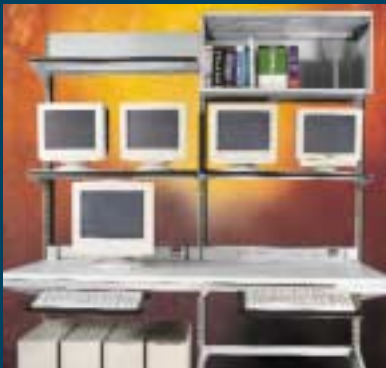
SPLIT BAY STATION: Adds flexibility by providing independently configurable bays.