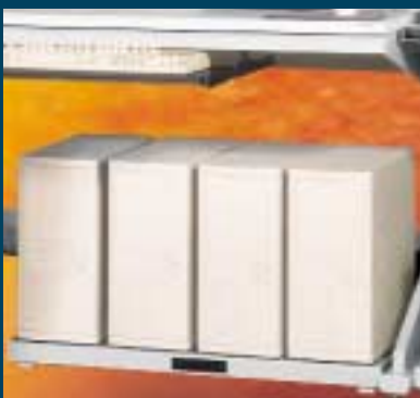
MOBILE SERVER SHELF: Stores tower units or other heavy equipment at floor level, on rollers, for easy access.