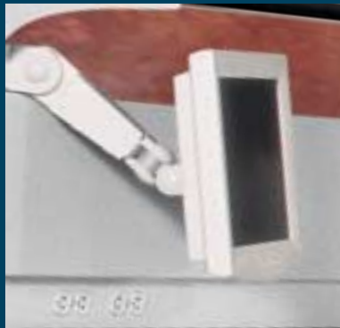
FLAT PANEL MONITOR ARM: Mounts in the macroslot of any support column and provides easily adjustable support for flat panel monitors.