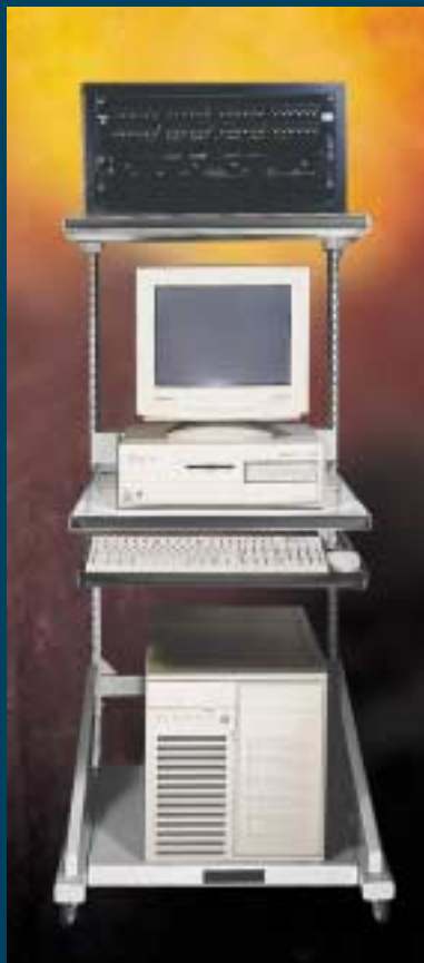
MOBILE RACK SHELF: Mobile shelf mounted assembly accommodates 19" (48 cm) rack mount equipment.