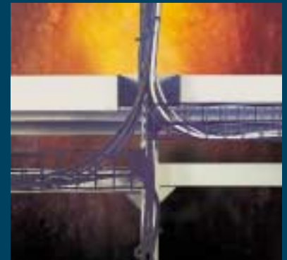
HORIZONTAL & VERTICAL WIRE MANAGERS: Controls wiring and cables, provides easy access for re-routing.