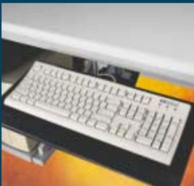
ARTICULATING ARM KEYBOARD SHELF: Adjusts to any operator's posture and preference; stores below worksurface when not needed.